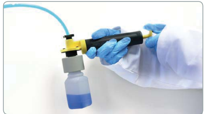
The pump is not a product contact part. Only the tube and collecting bottle come into contact with the product