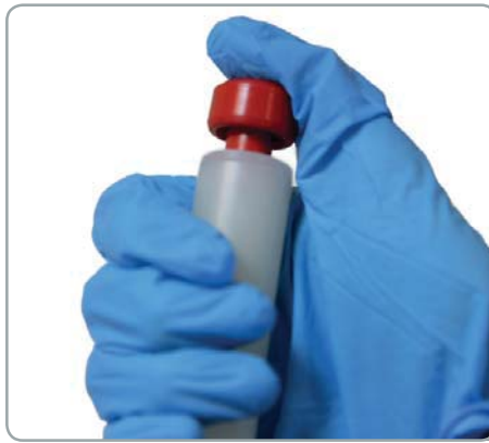
Push Button Press to take sample