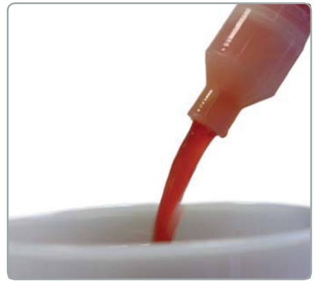
Quick & easy to use