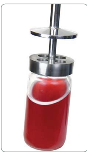
Bottle Sampler without Bottle Cover