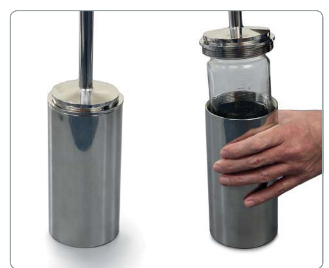
Sampler with protective cover that also helps to keep the bottle dry during sampling

Ideal for taking quick samples direct into the bottle. The sampler is available with a cover that goes over the bottle to stop the bottle from getting wet.