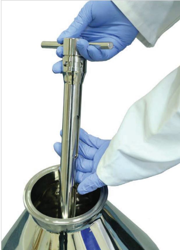
The Pod Sampler is simple to use.