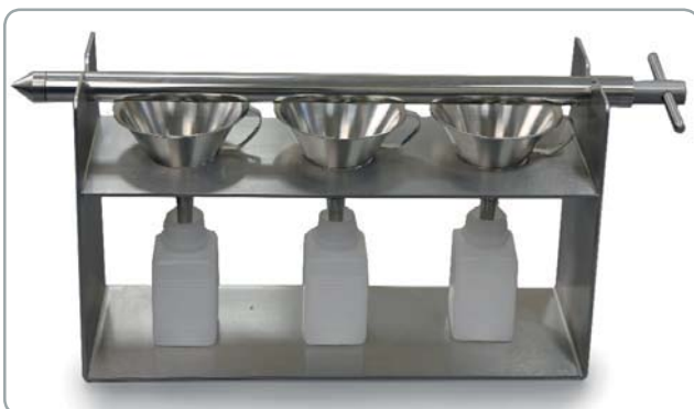
Pocket Sampler Holder