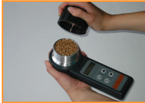
Figure 1a. Fill the measuring cell evenly to the top, ensuring the crop is level with the top of the cell. Screw on the cap and tighten until the stainless steel pressure indicator is flush with the top of the cap.