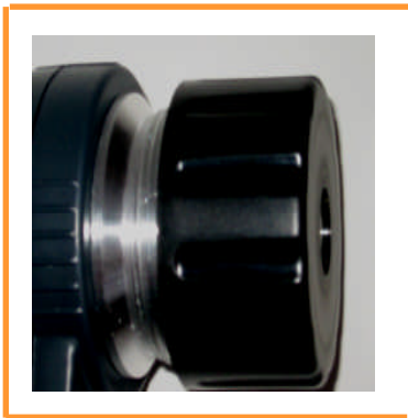
Figure 1 b

✘ Screw cap under tightened. Stainless steel indicator sunken in cap