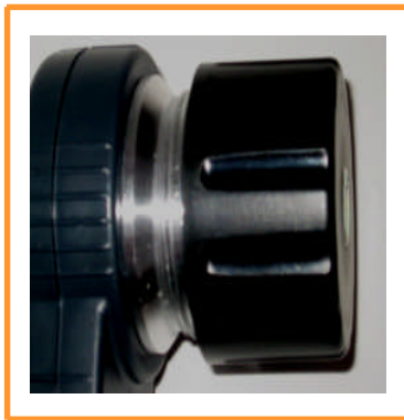
Figure 1 c

✘ Screw cap under tightened. Stainless steel indicator sunken in cap