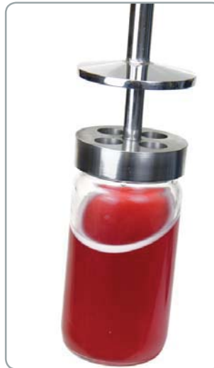
Bottle Sampler without Bottle Cover