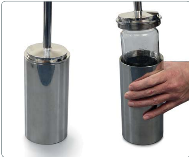
Sampler with protective cover that also helps to keep the bottle dry during sampling

Ideal for taking quick samples direct into the bottle. The sampler is available with a cover that goes over the bottle to stop the bottle from getting wet.