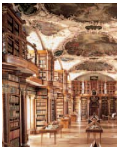
Museums, art galleries

The HygroPalm23 is ideal for all applications where precise measurement of humidity and temperature is required e.g. the food and pharmaceutical industries, printing and paper industries, the sciences, meteorology, agriculture, climatology and many more. There is hardly a field in which these parameters may be ignored. It is ultimately the measuring task at hand that defines the HygroPalm instrument and probe that best meets your needs.