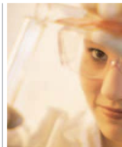
Healthcare, the sciences