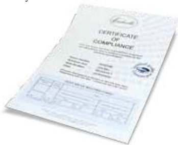
Certificate of Compliance Supplied with every test sieve

Endecotts test sieves are of the highest quality and are designed for accurate and efficient particle analysis.