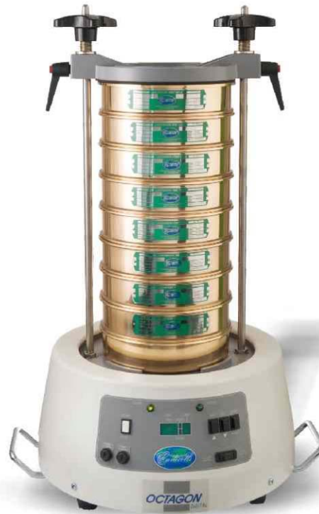
Sieves supplied separately