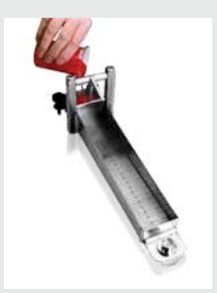
A measured sample up to 100 ml is placed in the reservoir behind the gate.