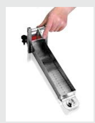
The gate is released by pressing the lock release lever - the spring action ensures it opens instantaneously.