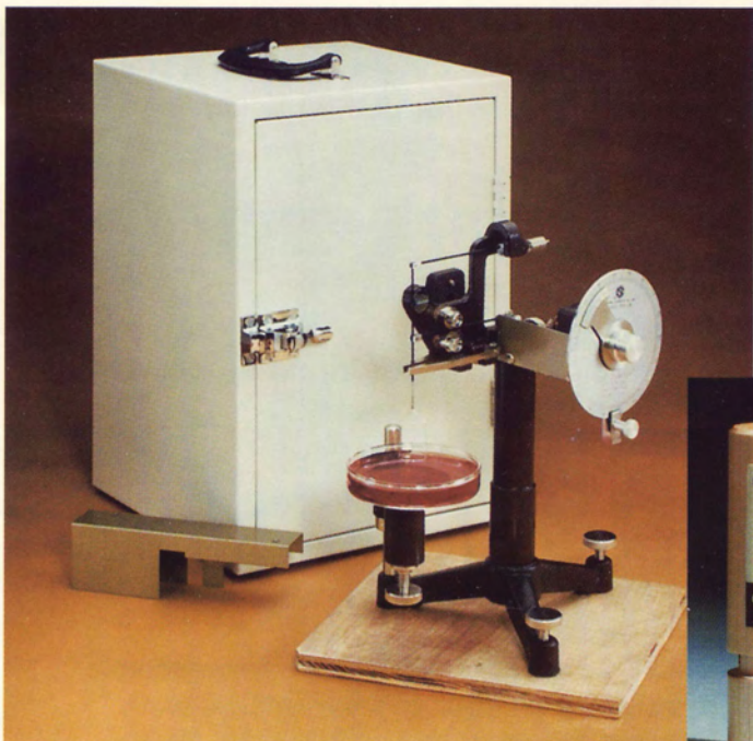
CSC DuNOUY INTERFACIAL TENSIOMETER

control of surface tension of the process liquid. A close relationship exists between interfacial tensions of oil-liquid systems and the lubricating value of the oil. Another major use is determining the sludging condition within a transformer, thereby eliminating costly repairs.