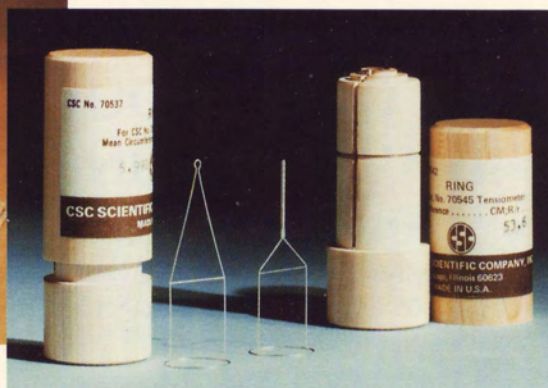
PLATINUM-IRIDIUM 6cm RING

CSC SCIENTIFIC also manufactures laboratory instruments for the analysis of: