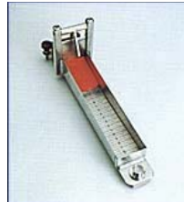
Fig.3. Records flow rate