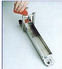
Fig.1. Fill Reservoir with sample

Release the gate by pressing the lock release lever, (the spring action ensures it opens instantaneously. (Fig.2) at the same time, start a stopwatch. At the end of the selected time period, determine how far the material has flowed along the trough. Take the maximum reading at the center of the trough and the minimum reading at the edge of the trough and average the values. (Fig.3) The average value is then compared against previously determined standards.