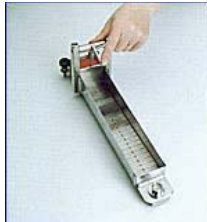
Fig.2. Release Gate