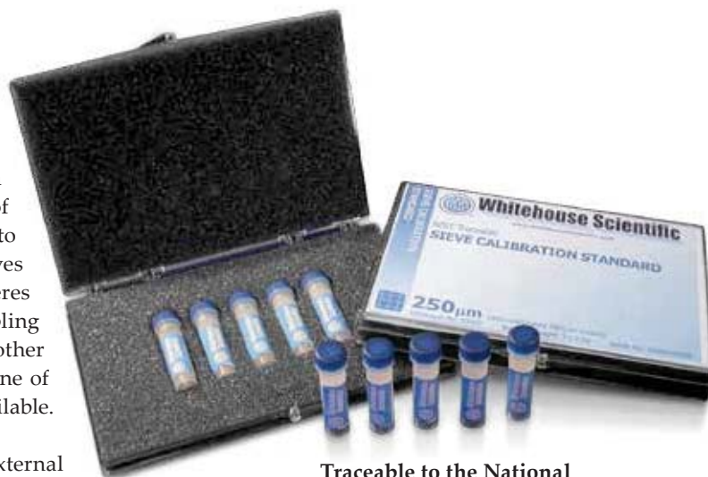
Traceable to the National Physical Laboratory

The samples are supplied in 'Single Use' vials complete with calibration certificate.